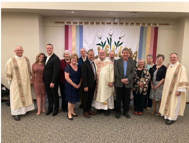
RCIA Team with Candidates & Sponsors at Easter Vigil Mass